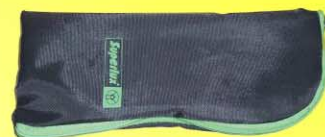
soft-side protective case